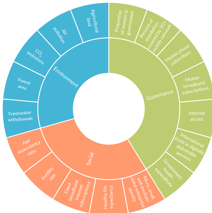
Figure 1: GOI's Future Environment of Growth Variables

Additionally, the variables included in Future Environment of Growth (see Figure 1) help monitor a country's efforts in building a resilient and sustainable economy and society. More specifically, they focus on assessing the country's support of a diversified and qualified labor force, environmentally conscious business models, and good corporate governance.